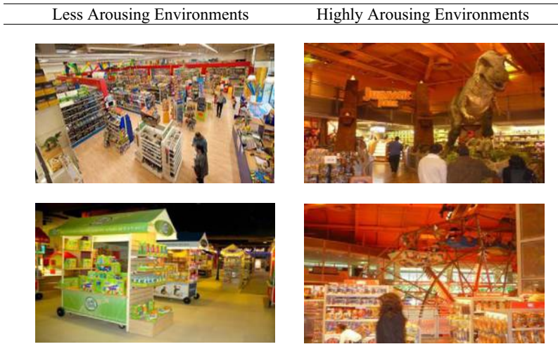
Figure A1. Sample pictures used in the main study